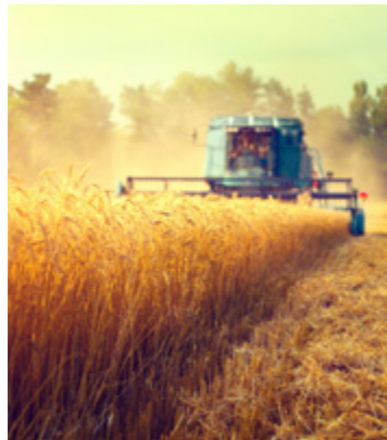
Manufacturing & Agriculture