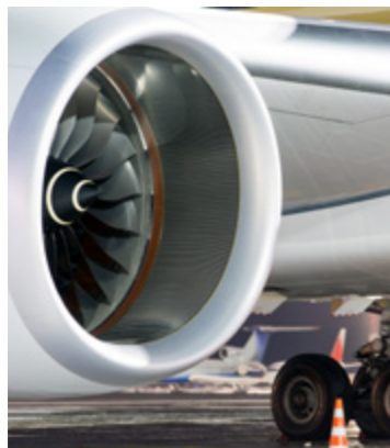
Aerospace & Defence

Our commercial damages experts have been engaged on a variety of projects around the world and possess specialist industry experience. We have regularly consulted on behalf of both listed and private global companies, governments, claimants and respondents, across various industries, including: