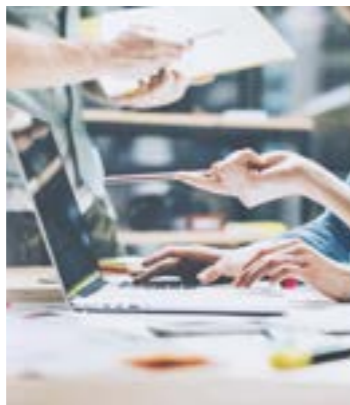
Media, IT & Telecommunications