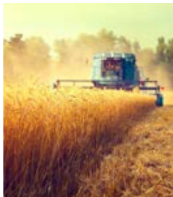
Manufacturing & Agriculture