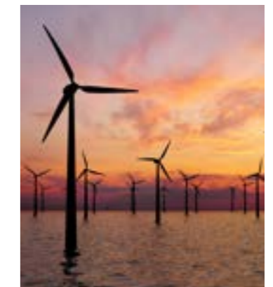
Power & Utilities