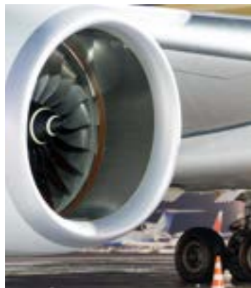
Aerospace & Defence

Our commercial damages experts have been engaged on a variety of projects around the world and possess specialist industry experience. We have regularly consulted on behalf of both listed and private global companies, governments, claimants and respondents, across various industries, including: